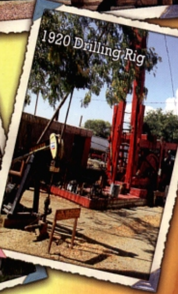
1920 Drilling Rig