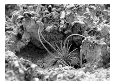
Cryptobiotic soil crust

Natural Bridges preserves habitat for a variety of plants and animals. Visitors may see mule deer browsing, hear the falling notes of a canyon wren, or smell the sweet aroma of spring wildflowers. To guard these experiences for future generations, please observe the following regulations: