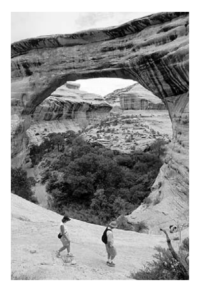
Hikers make their way down the trail to Sipapu Bridge.