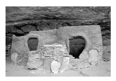
Horsecollar Ruin earns its name from the shape of the doors to these granaries.