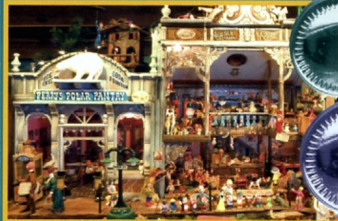
Life in the Western Town.

"This is that place your friends told you not to miss!"