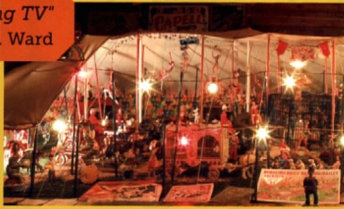
Under the Big Top at Tinkertown.