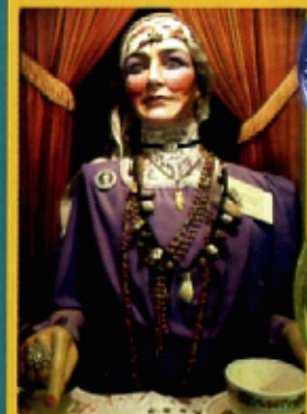
For 25¢ Esmerelda will tell your fortune!