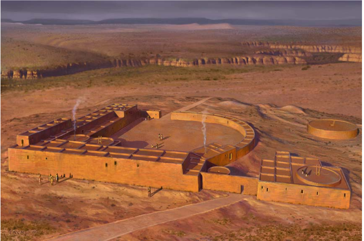
Illustration by Cory Ench of Pueblo Pintado it may have appeared in AD 1100, based upon a model by Ron Cox.

THE NAME – In 1849, the Washington Expedition, a military reconnaissance under the direction of Lt. James Simpson, surveyed Navajo lands. As the party traveled west from Santa Fe, Pueblo Pintado (Spanish for "painted village") was the first Chacoan site they encountered. Carravahal, a Mexican guide with the expedition named the site. Pueblo people on the expedition called it Pueblo de Montezuma . This Chacoan site was also known as Pueblo de los Ratones , or "village of the mice," Pueblo Colorado or "red village," and Pueblo Grande , or "large village." Its Navajo name is Kin teel , or "wide house."