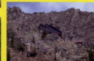
Amazing 1904 Boardinghouse