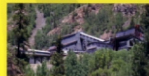
1929 Mayflower Gold Mill