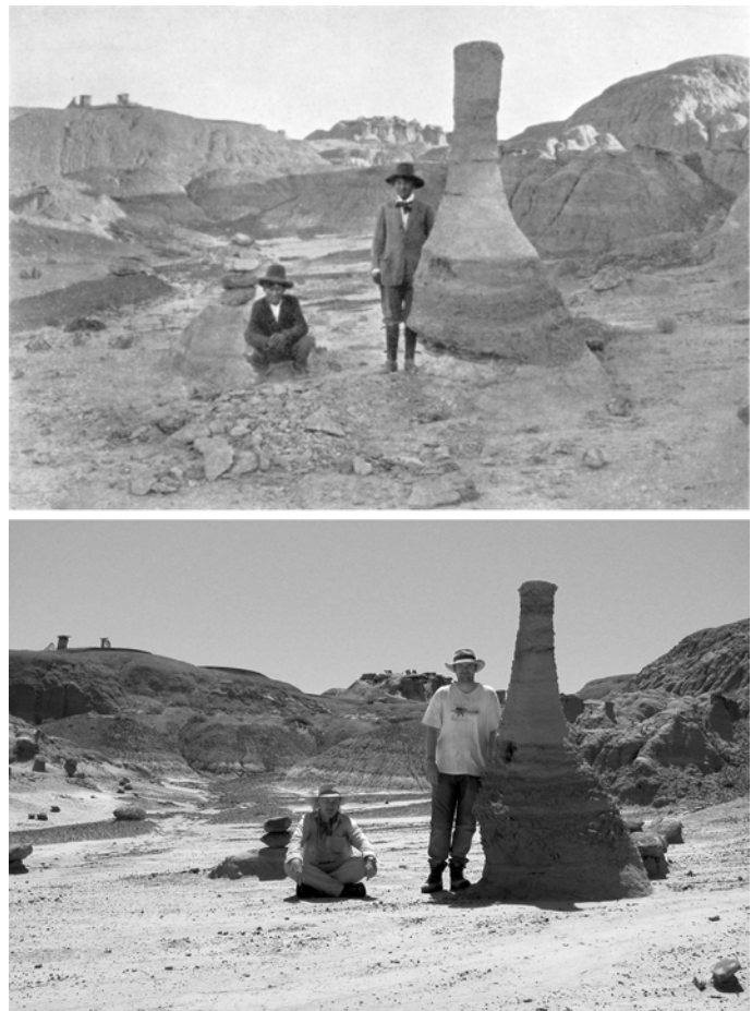
FIGURE 4. Sternberg’s hoodoo site in 1921 (top) and 2003 (bottom). Note the excavation scar and debris at the based of the hoodoo in the 1921 photo. This is probably the site of specimen (no. 107) sold to the University of Uppsala. Today, the scar of Sternberg’s collecting is still evident (below).

SMP VP-1086, centrum ( Melivius chauliodous ); VP-1090, incomplete skull of a juvenile Parasaurolophus sp. (this specimen was pub-