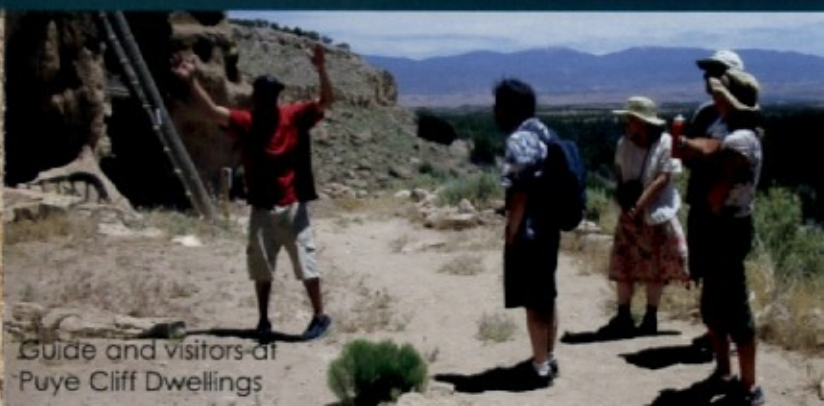
Guide and visitors at Puye Cliff Dwellings