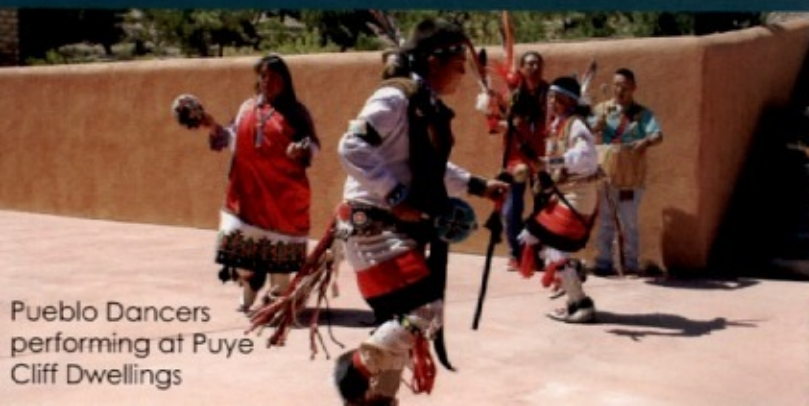
Pueblo Dancers performing at Puye Cliff Dwellings

Behind the Harvey House, the Puye Cliff Face Trail guides visitors in the world of the Puye ancients. On this tour, a Puye Cliffs Tour Guide will introduce you to everyday life on the Puye Cliff Face through detailed information about early habitation and architecture. You will see masonry dwellings, cavate dwellings sculpted from the volcanic rock of the Parajito Plateau and petroglyph's of the Puye people. The Puye Dwellings Tour involves walking on steep slopes (paved) at high elevations.