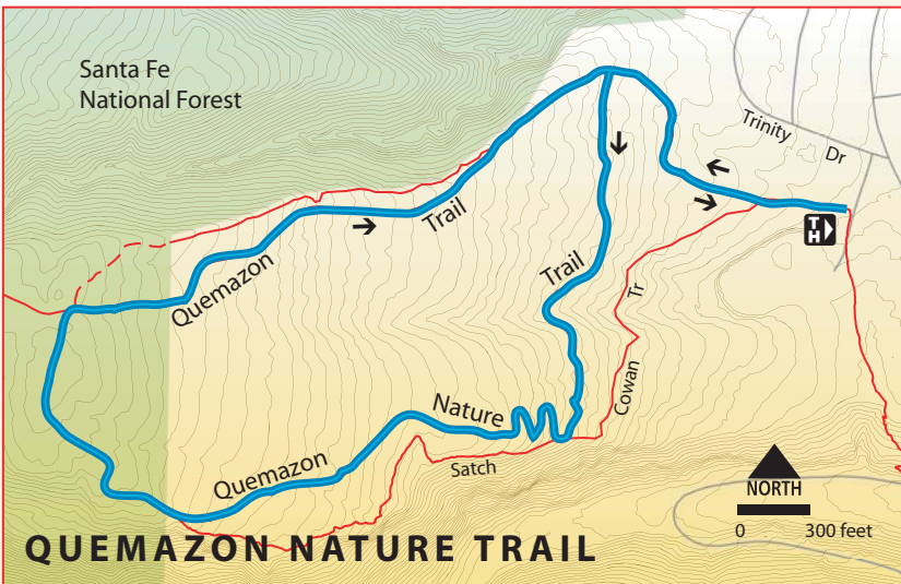
QUEMAZON NATURE TRAIL

From the trailhead, travel up hill on a wide dirt road, passing the Satch Cowan Trail. In a few minutes, pass to the left of a green gate at a water tank and turn left onto the nature trail. Follow the trail as it winds up the mesa. After marker 28, continue on the trail as it swings to the north. In a minute, reach the Quemazon Trail, turn right, and return to the trailhead.