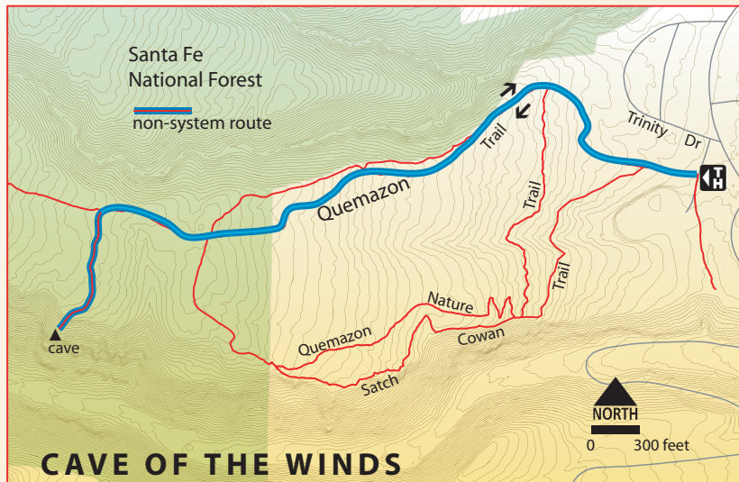
CAVE OF THE WINDS

(this is just after the trail begins climbing again). Turn left and follow the winding trail to the edge of Los Alamos Canyon. The cave is 100 feet below the rim, down a staircase of rock in small notch in the cliff. Use caution, but it is a safe and relatively easy descent. You have to watch carefully for the entrance to the cave, which is a horizontal slit in the rocks.