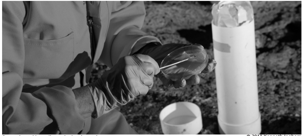
Researcher taking soil samples in a lava tube