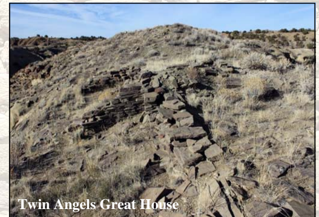
Twin Angels Great House

Twin Angels has several distinctive Chacoan architectural characteristics including core and veneer walls, preplanned architecture and an enclosed Kiva along the southwest side. To the south of the main structure is a low-walled room which has been identified as a herradura - a prehistoric road-related feature.