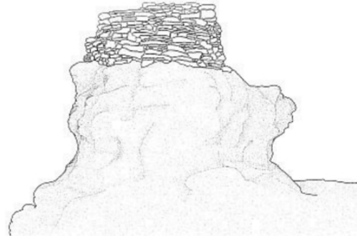
EAST ELEVATION SCALE 3/8" = 1'