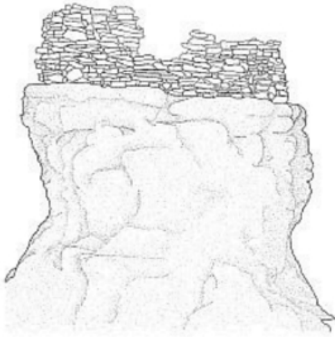
SOUTH ELEVATION SCALE 3/8" = 1'